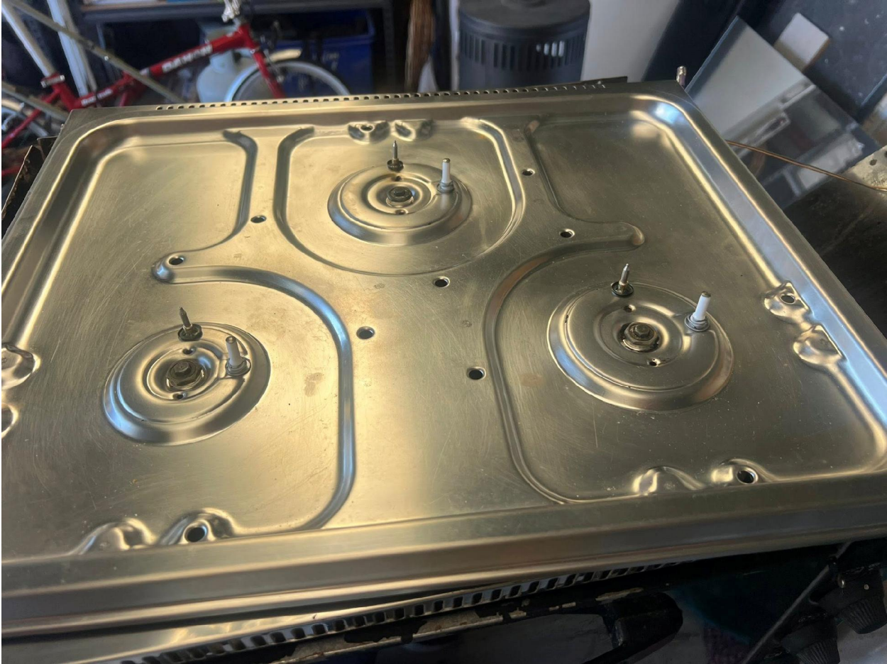
Thermocouples and igniters in place